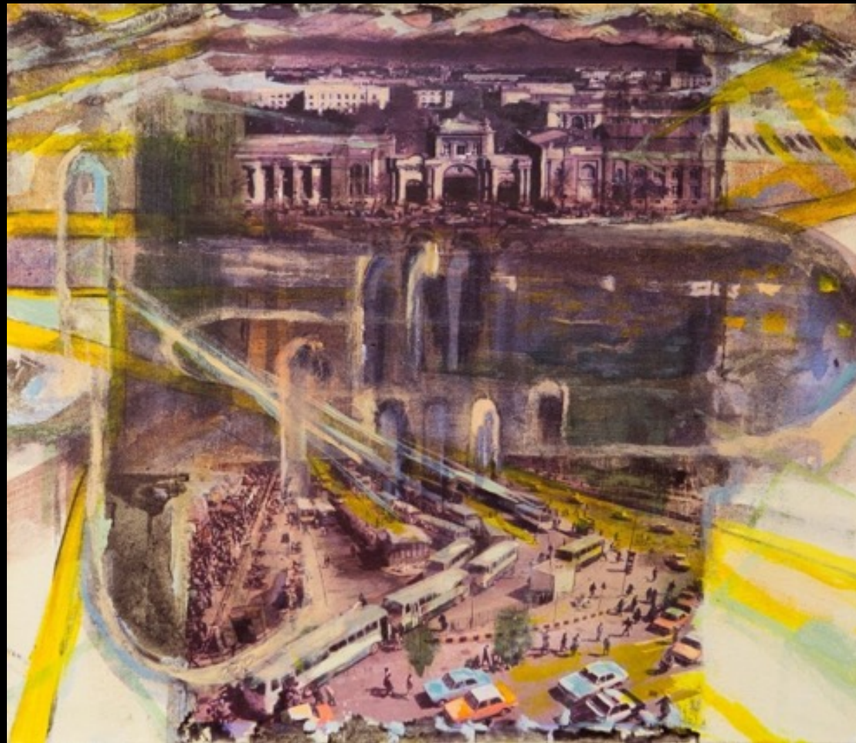
National Garden, Tehran Mixed Media on Canvas 17.5" x 15" 2016