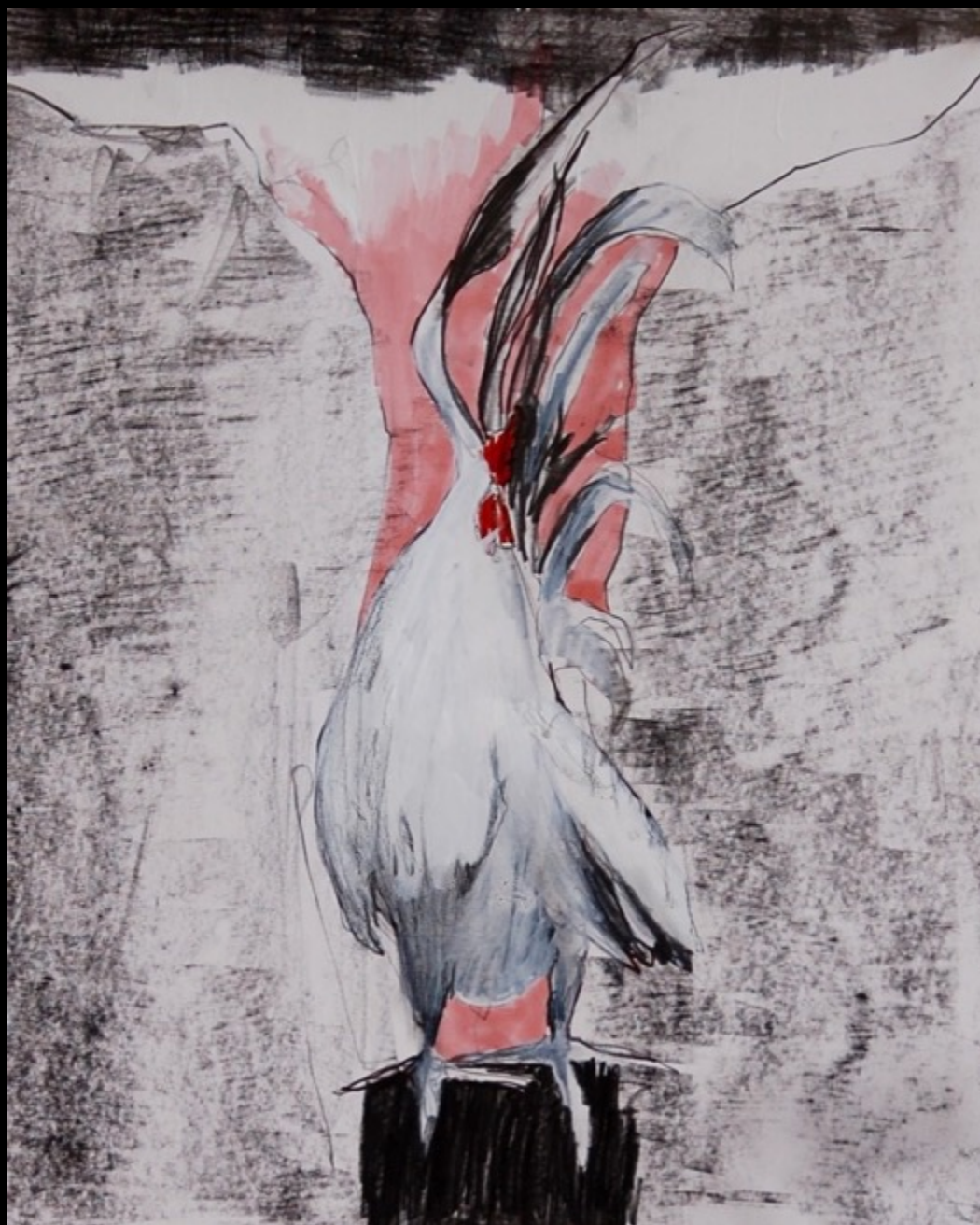
mixed media on paper 14"x17" 2014