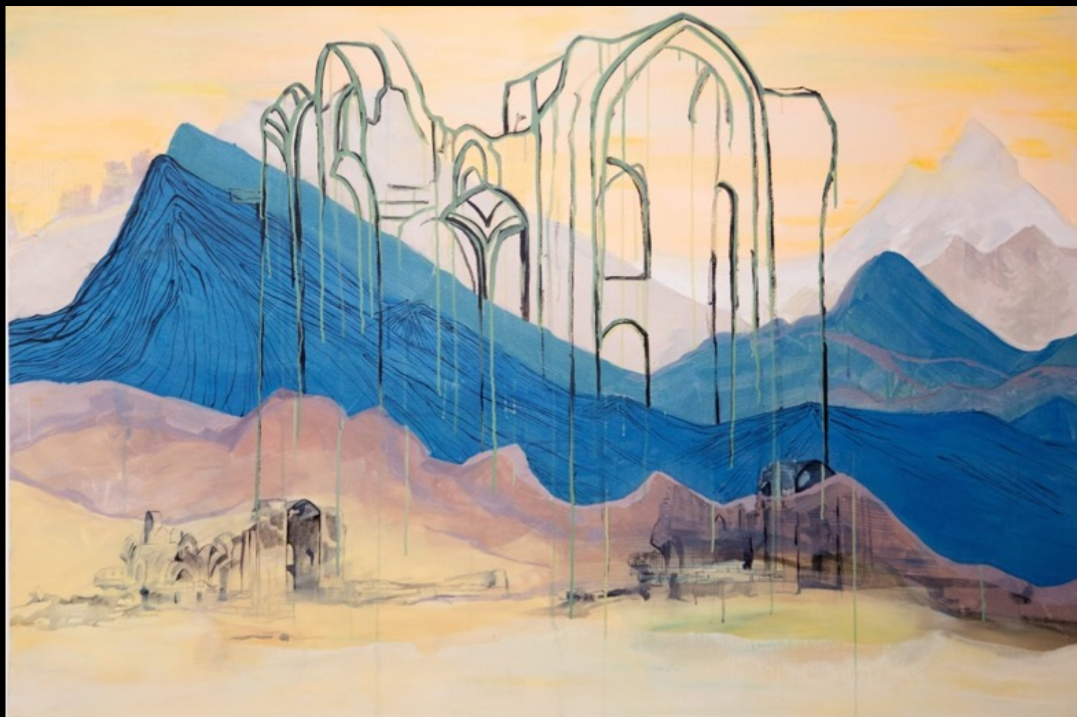
Liaison #1 Mixed Media on Canvas 49".72" 2015