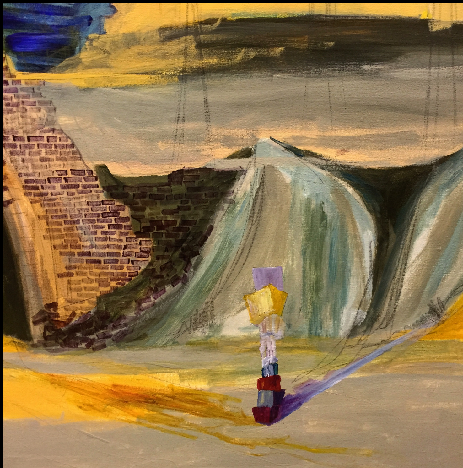
Detail, 2018 40x52 inches Mixed media on canvas