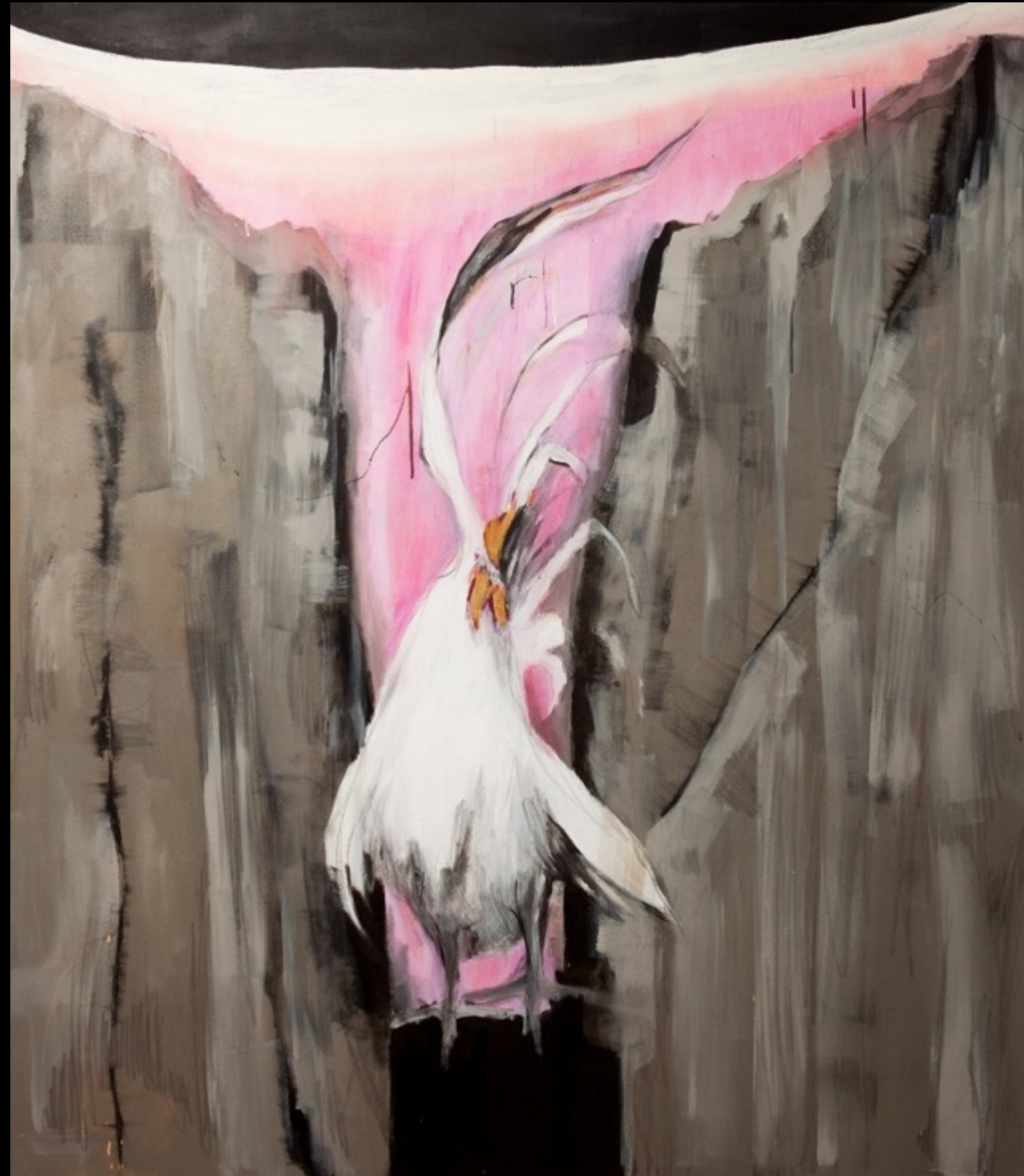
Mixed Media on Canvas 72"x63" 2015