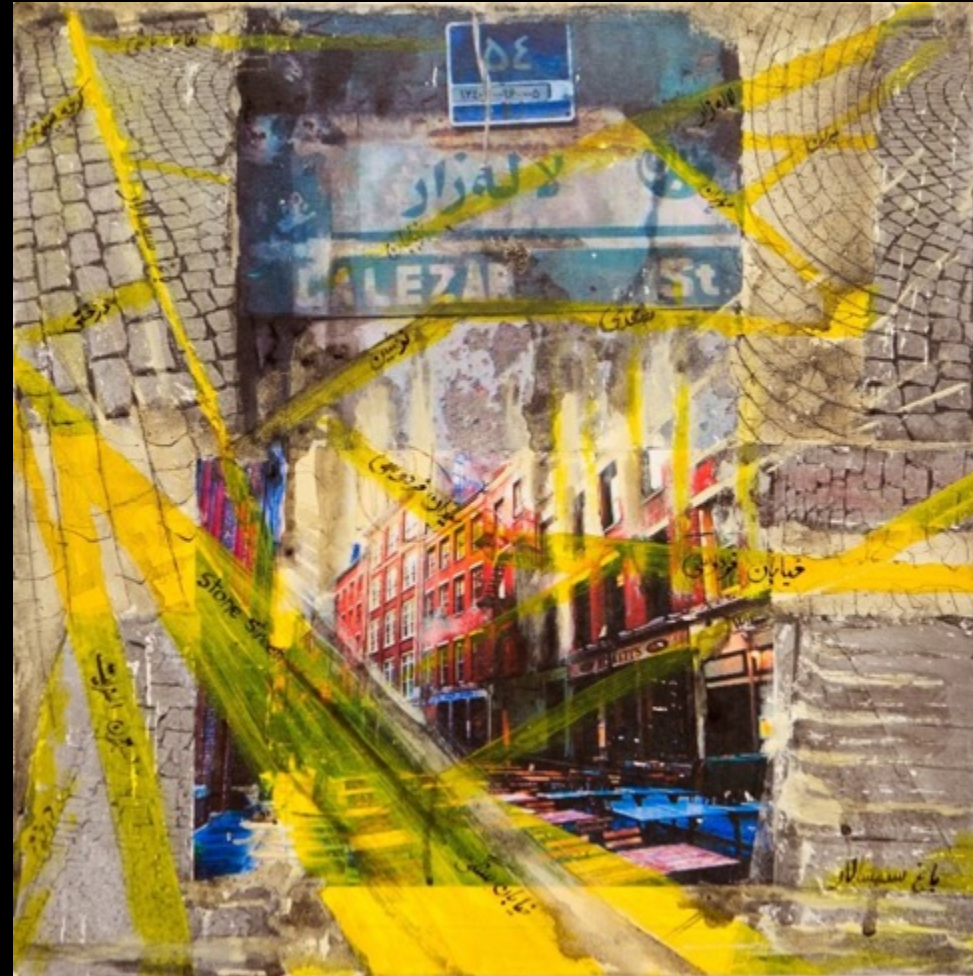
Laleh Zar St, Stone St Mixed Media on Canvas 18" x 18" 2016