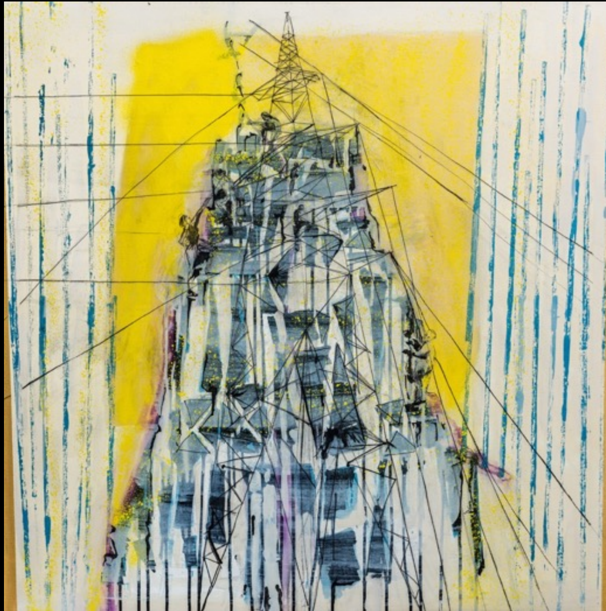
The Tower of Babel, 2018 38x38 inches Mixed media on canvas