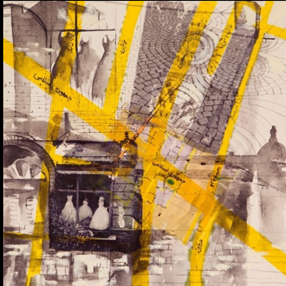
Brides of Mokhbero doleh Mixed Media on Canvas 18" x 18" 2016