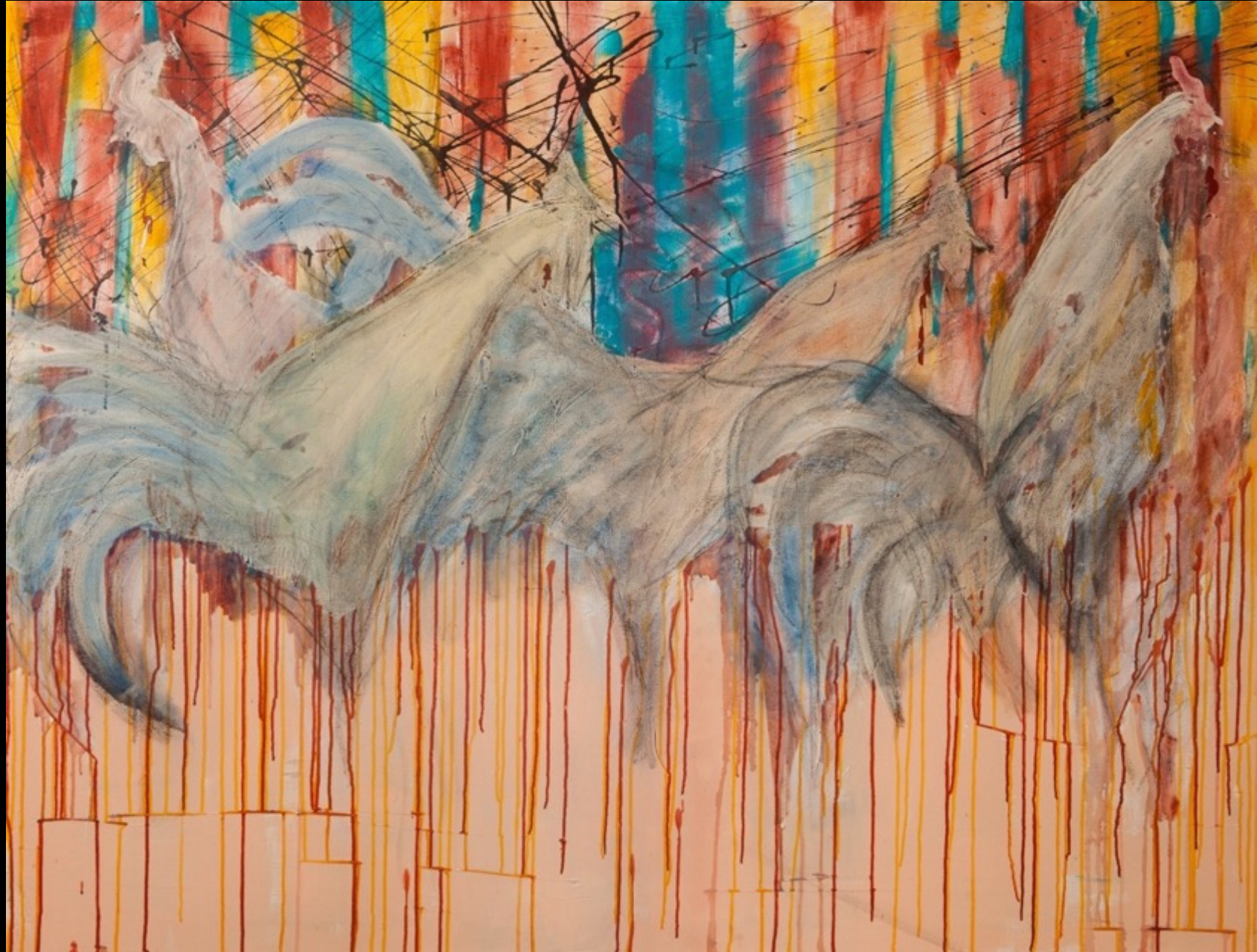
Mixed Media on Canvas 51"x67" 2015