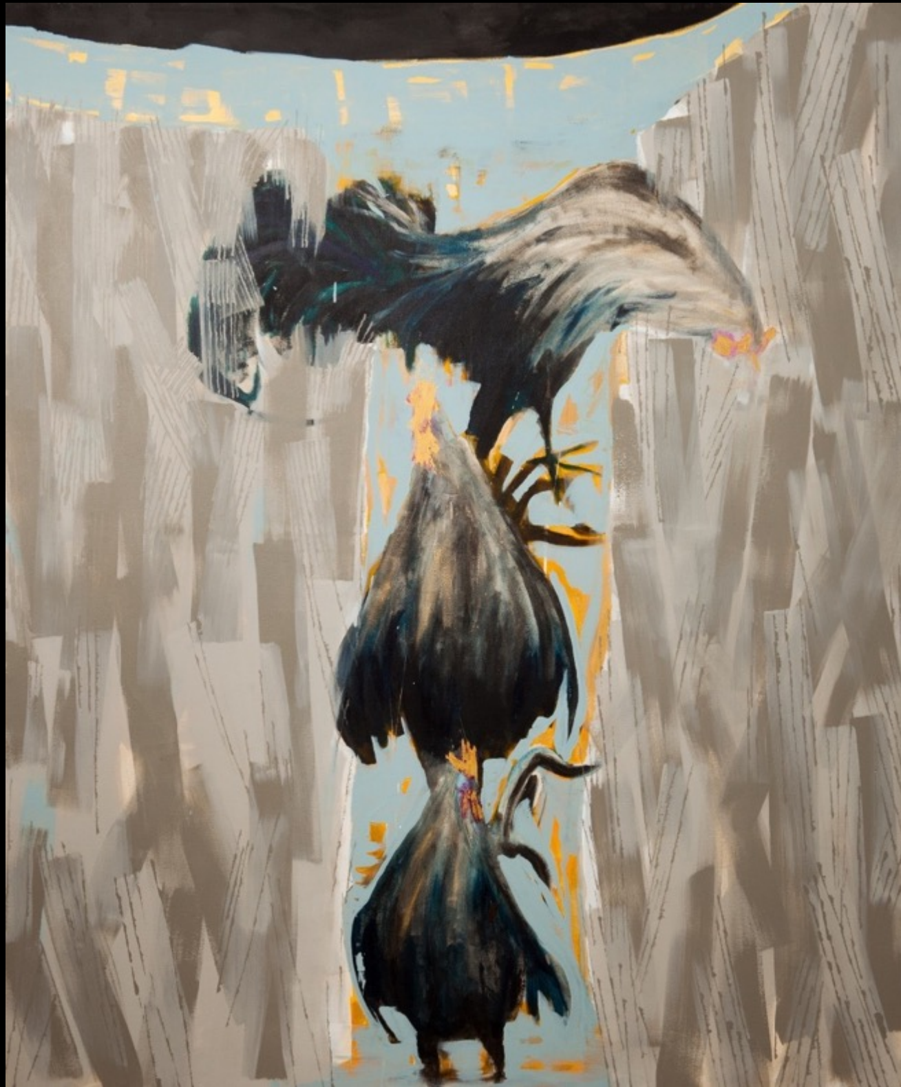
Mixed Media on Canvas 72"x60" 2015