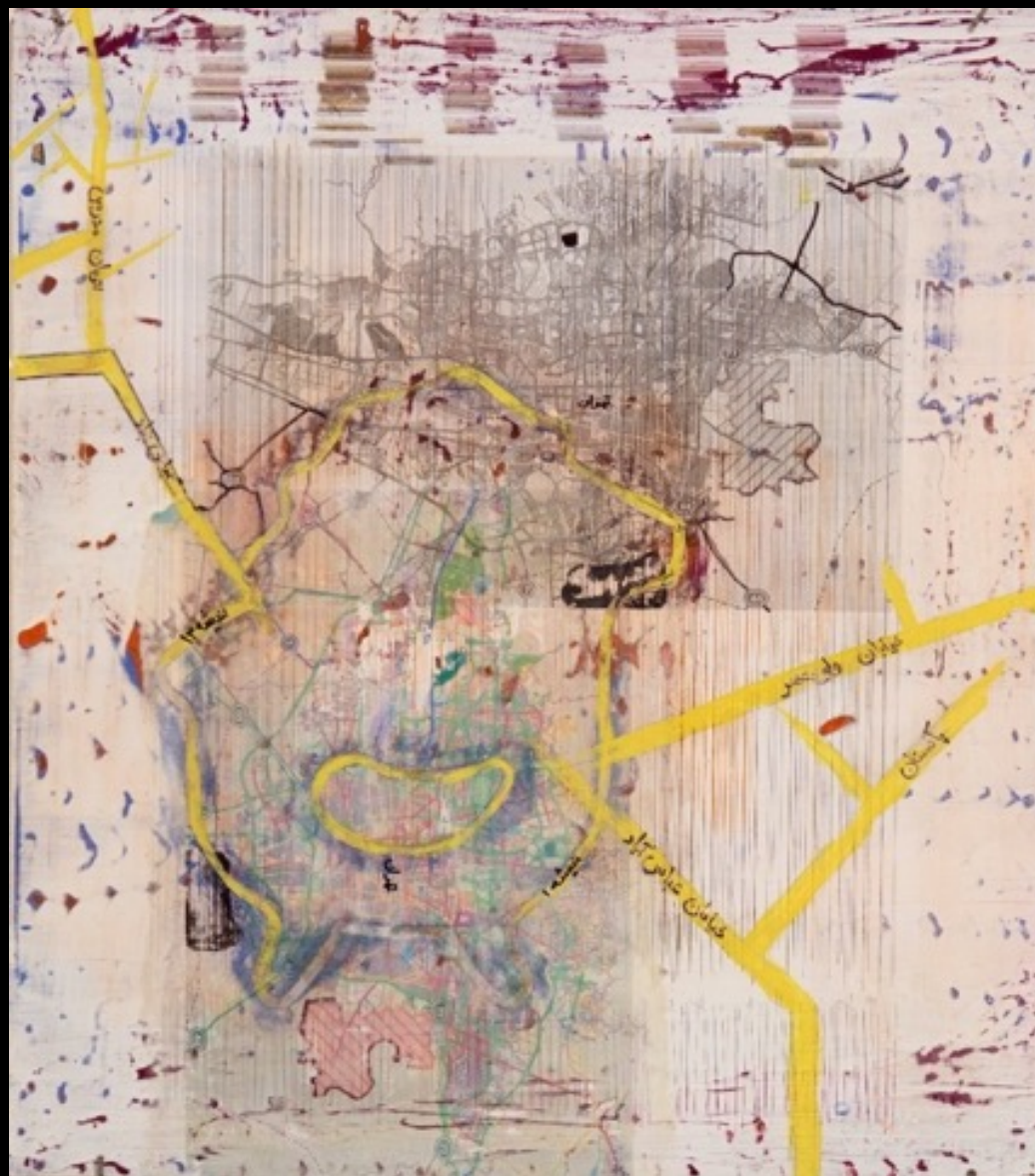
Tehran Mixed Media on Board 16" x 18" 2016