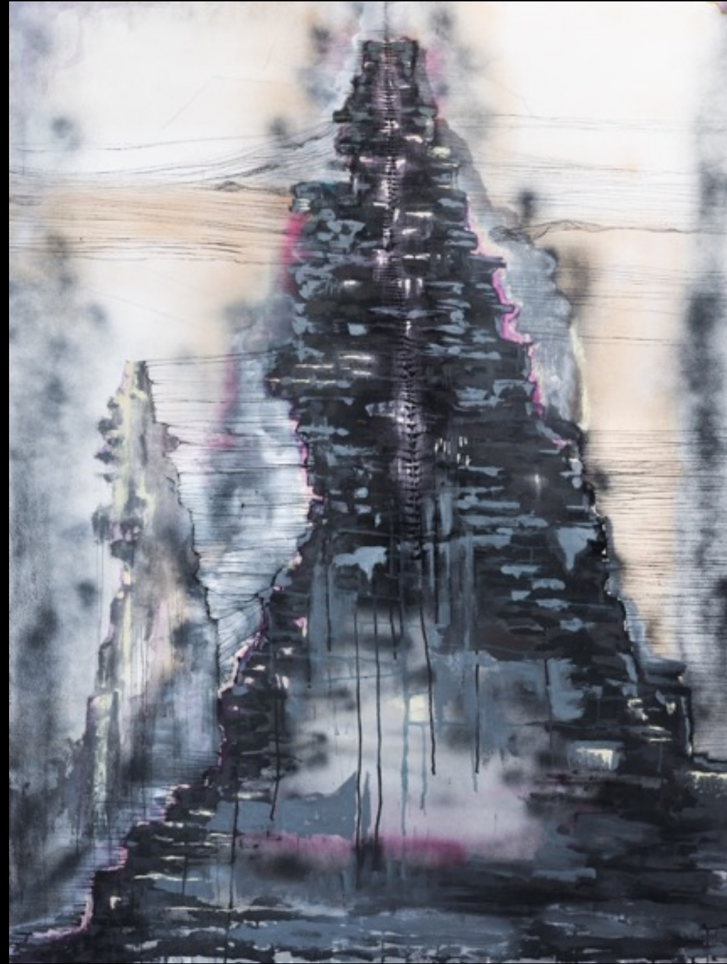
Tower I, 2017 51x67" Mixed media on Canvas