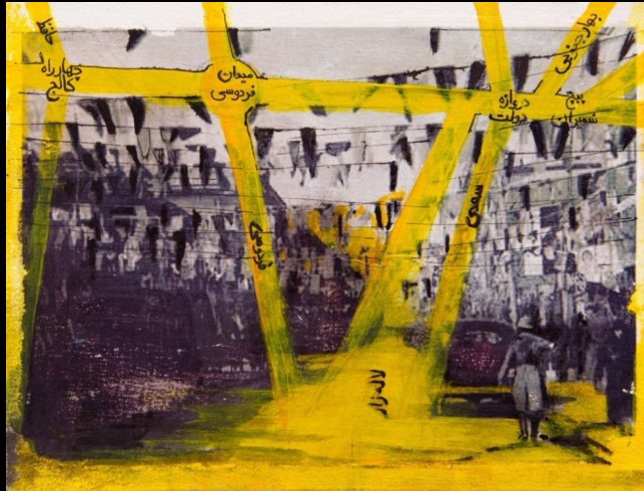
Laleh Zar St, Mixed Media on Canvas 8.5"x 11.5" 2016