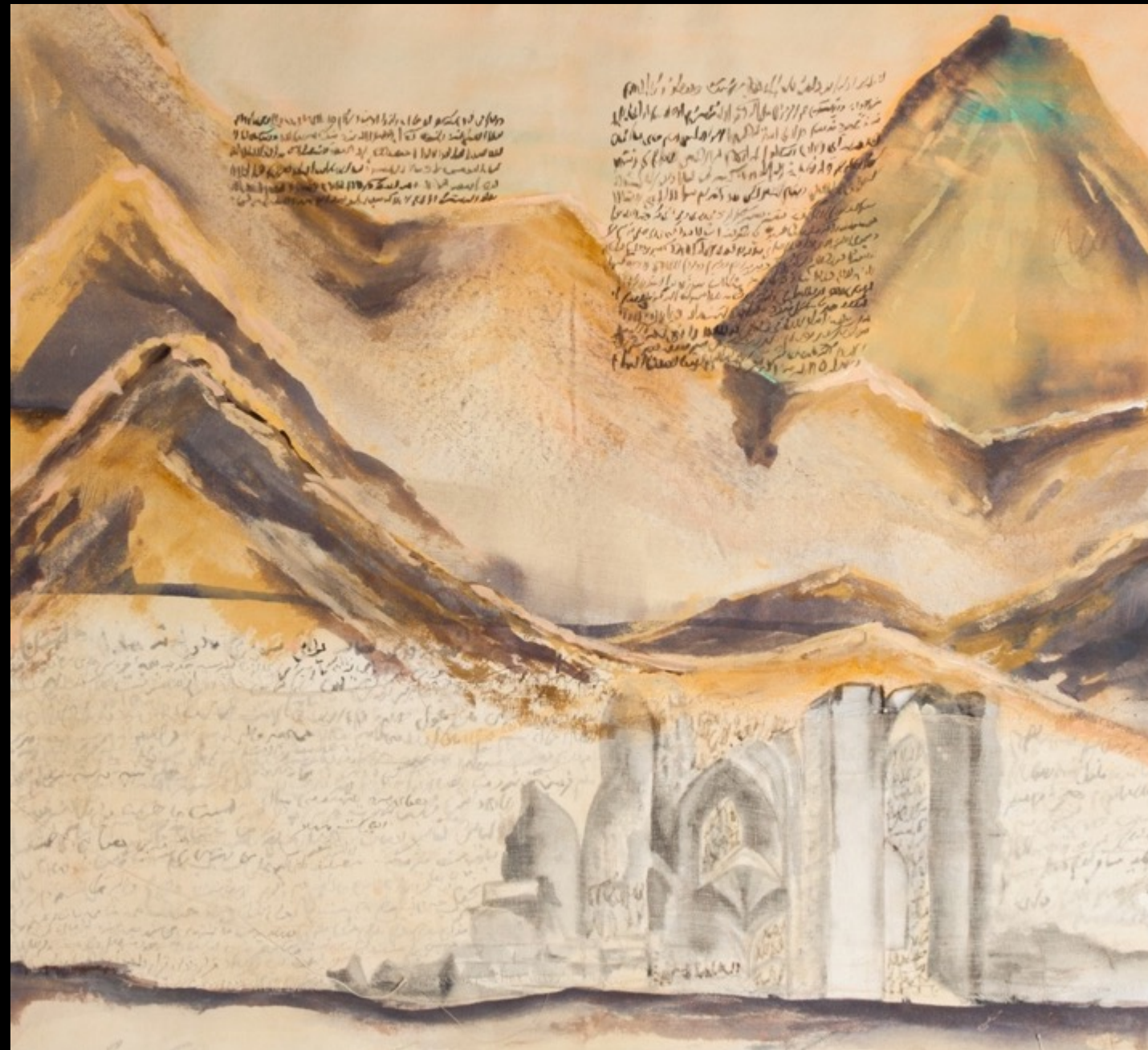
Mixed Media on Canvas 31"x28" 2014