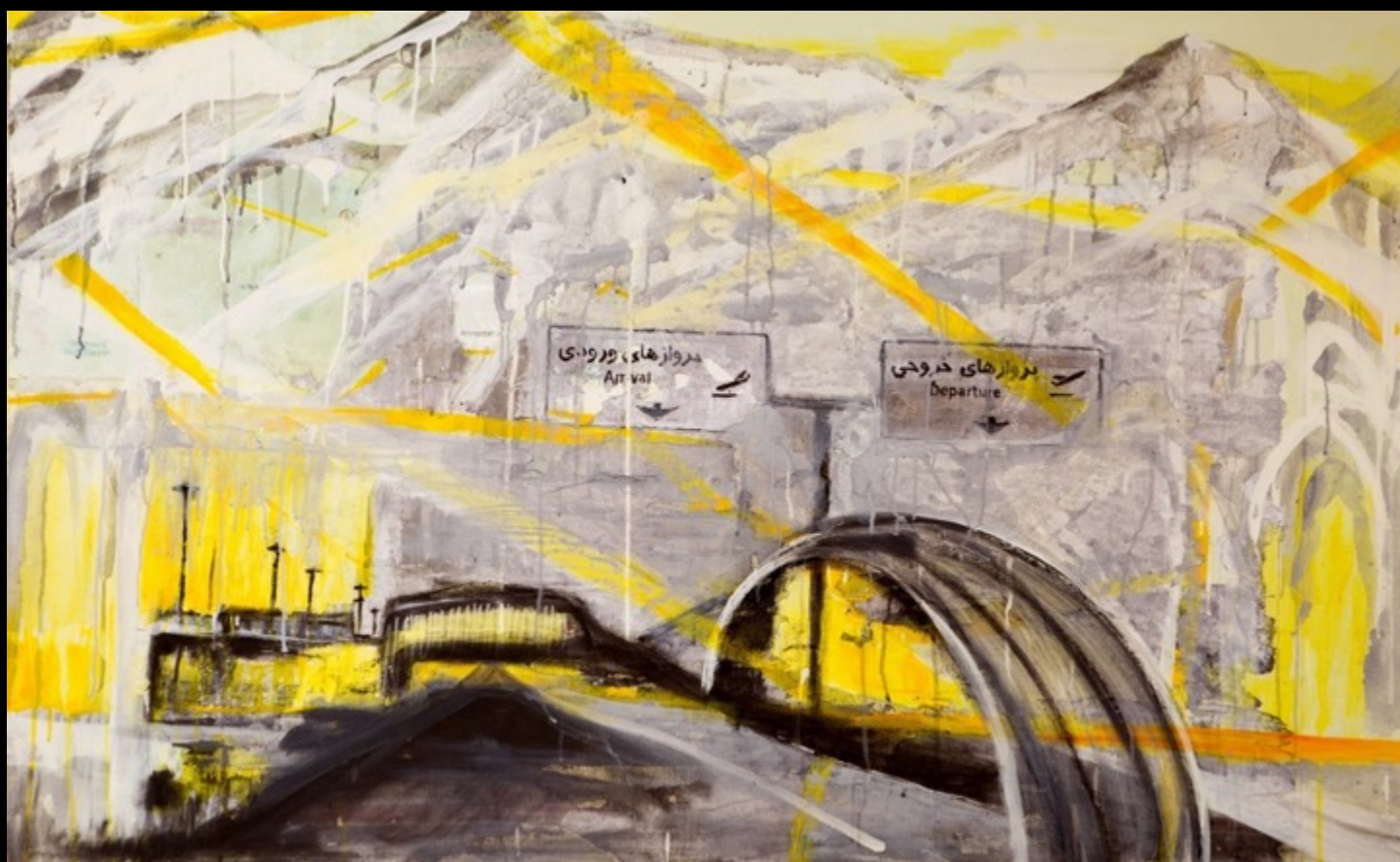
Take the departure Mixed Media on Canvas 35.5" x 57" 2016