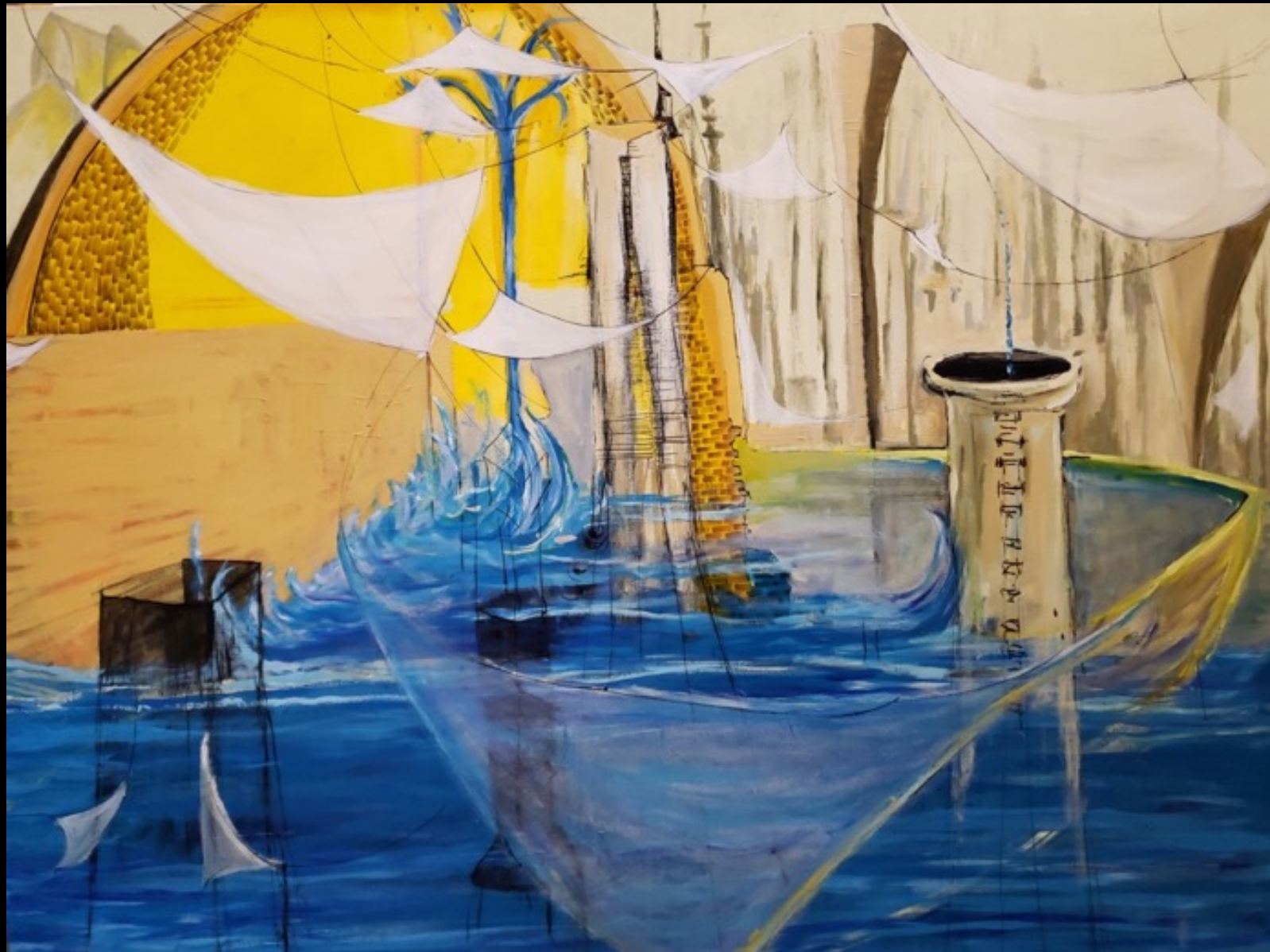
Floating Cities, 2018 40x52 inches Mixed media on canvas