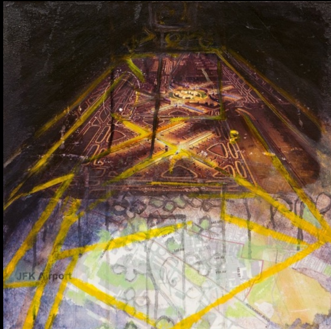
Imam and JFK airport Mixed Media on Canvas 18" x 18" 2016