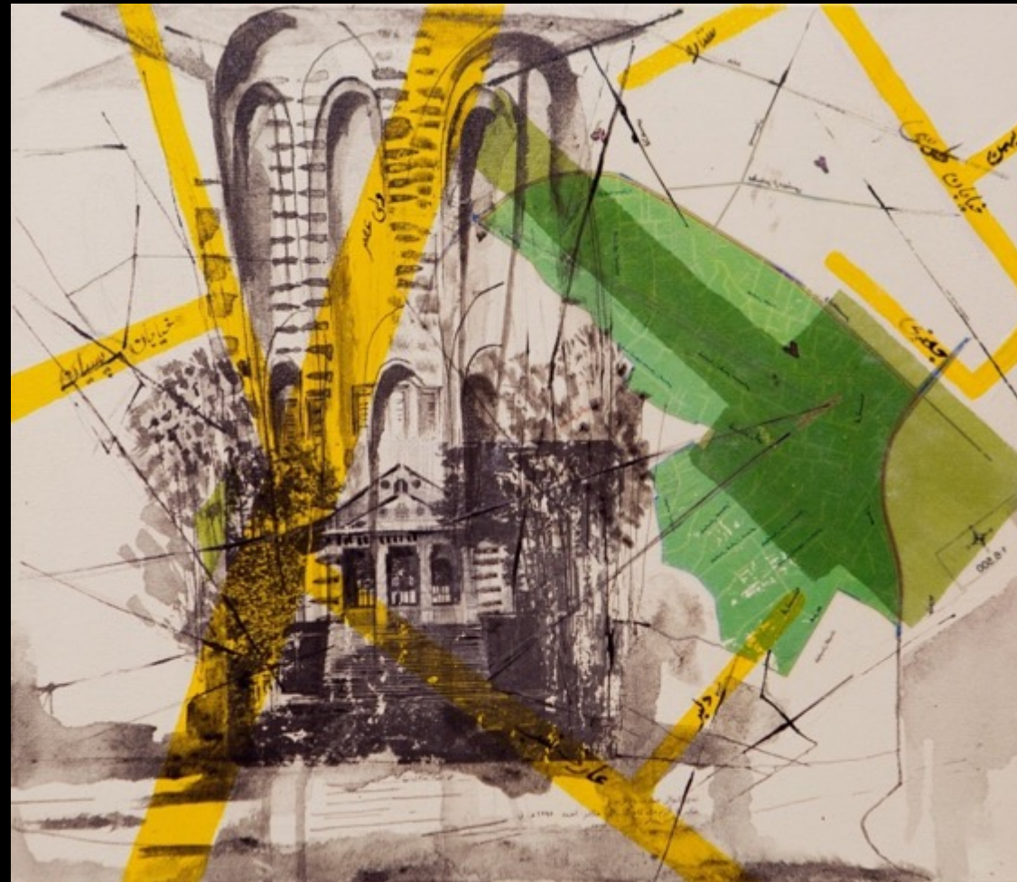
Ferdows Garden Mixed Media on Canvas 17.5" x 15" 2016