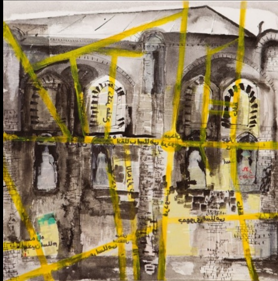
Bridal Windows Mixed Media on Canvas 18" x 18" 2016