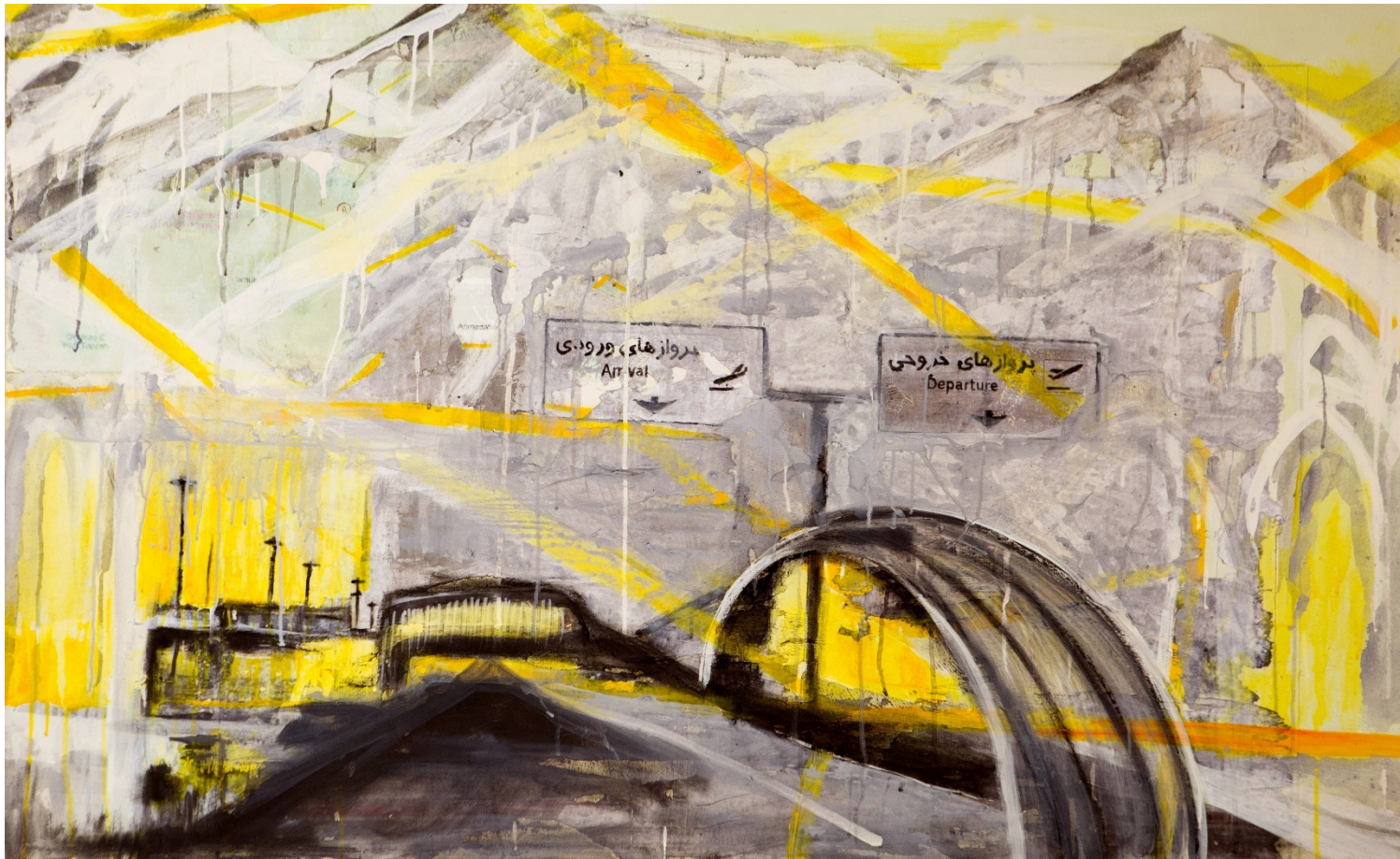
Take the departure Mixed Media on Canvas 35.5" x 57" 2016