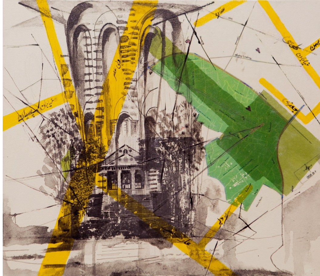
Ferdows Garden Mixed Media on Canvas 17.5" x 15" 2016