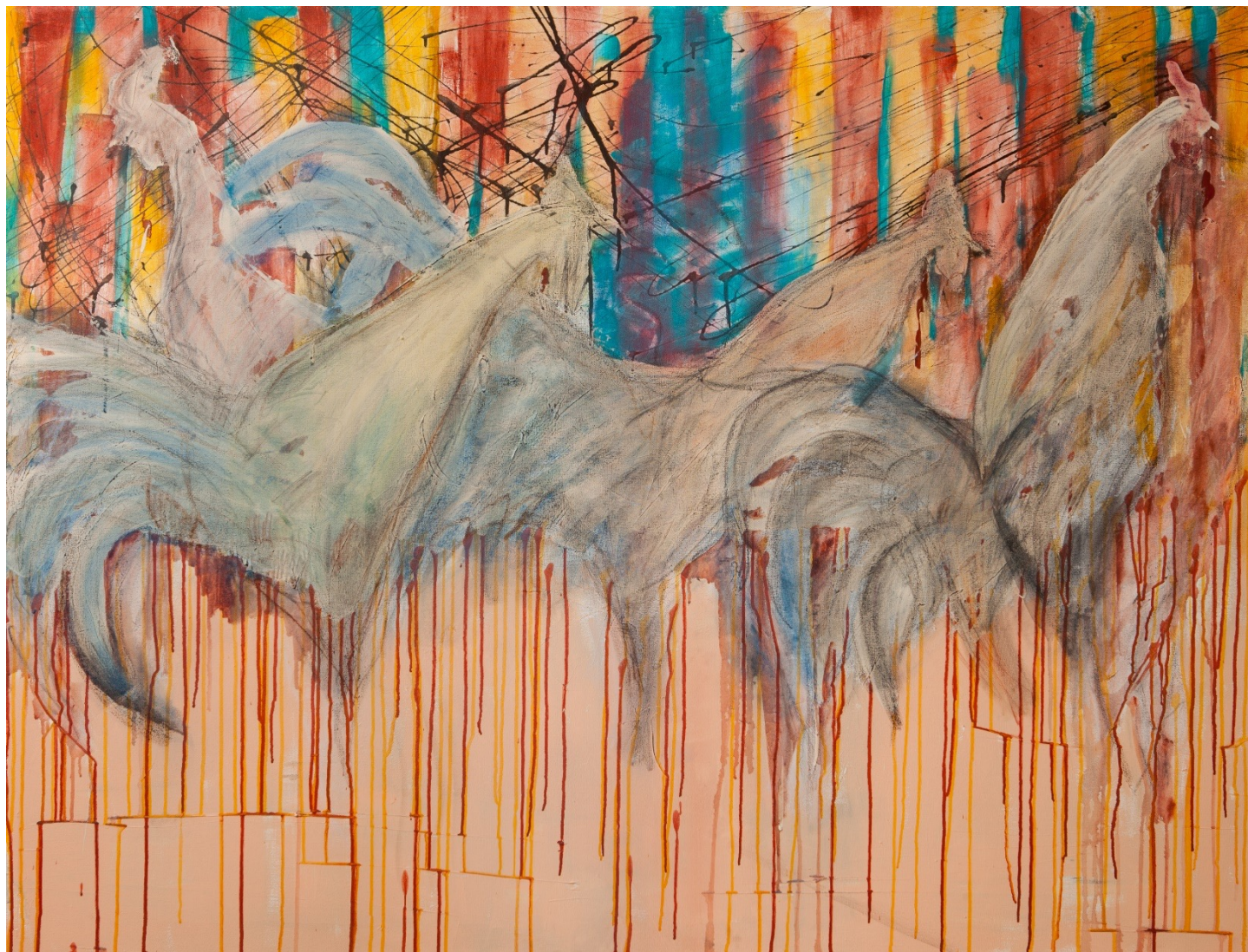
Mixed Media on Canvas 51"x67" 2015