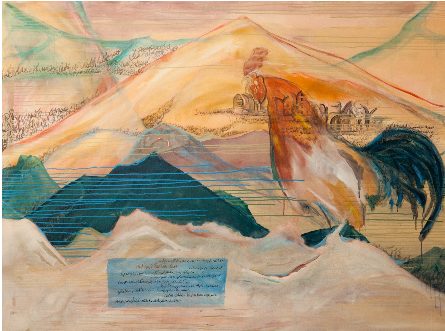
Mixed Media on Canvas 78"x59" 2014