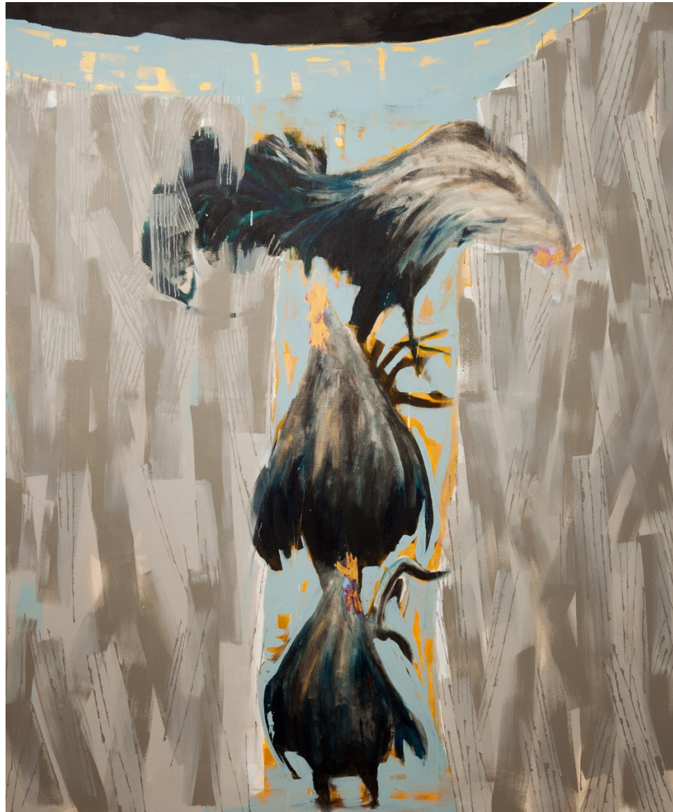
Mixed Media on Canvas 72"x60" 2015