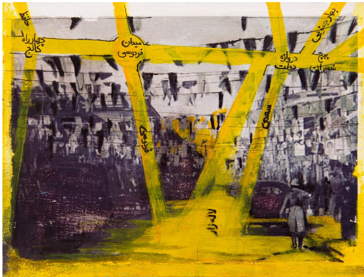
Laleh Zar St, Mixed Media on Canvas 8.5"x 11.5" 2016