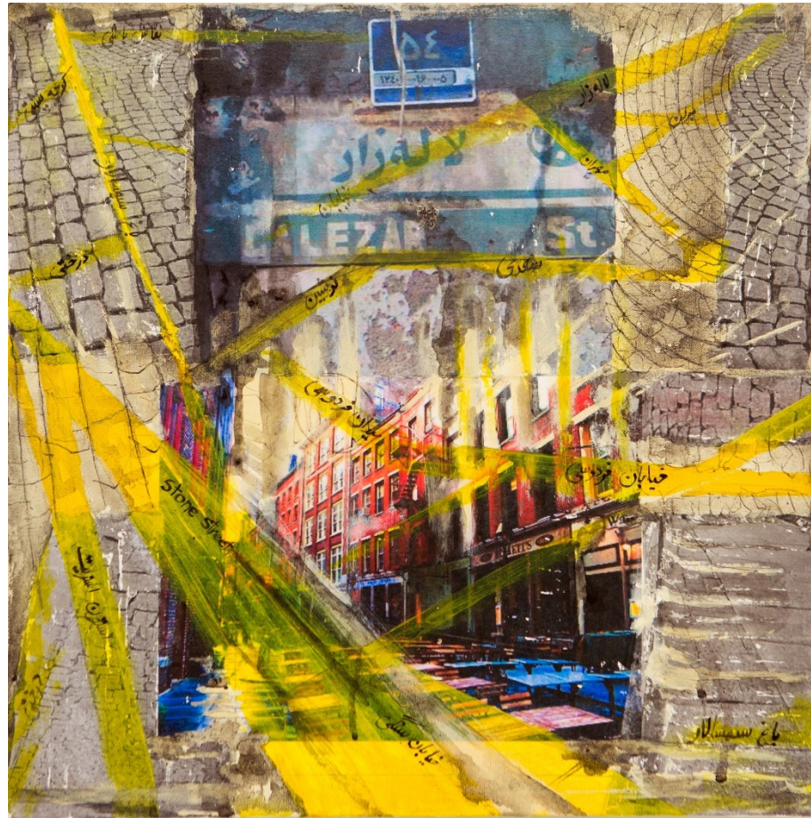
Laleh Zar St, Stone St Mixed Media on Canvas 18" x 18" 2016