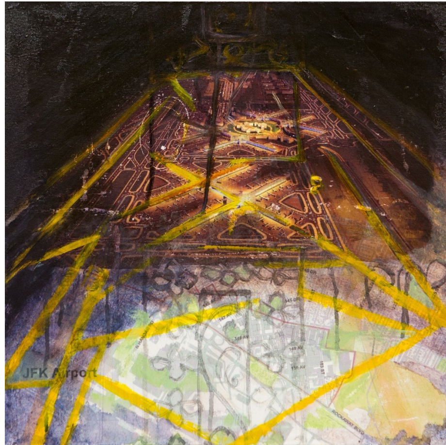
Iman and JFK airport Mixed Media on Canvas 18" x 18" 2016