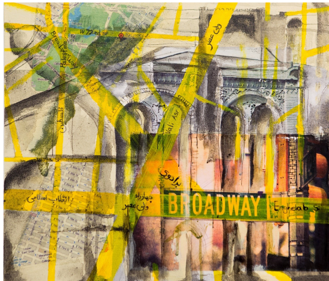
Manhattan Strip Mixed Media on Canvas 17.5" x 15" 2016