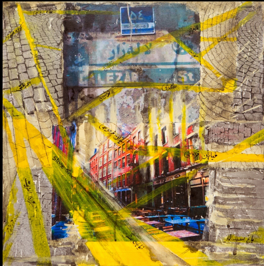
Laleh Zar St, Stone St Mixed Media on Canvas 18" x 18" 2016