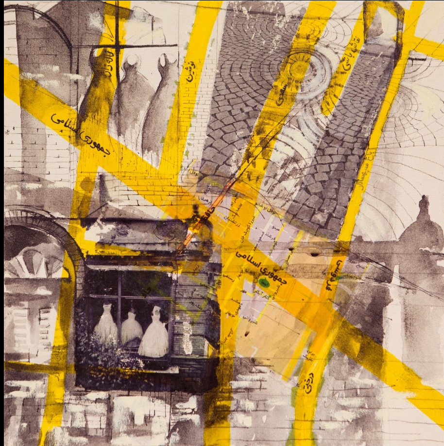
Brides of Mokhbero doleh Mixed Media on Canvas 18" x 18" 2016