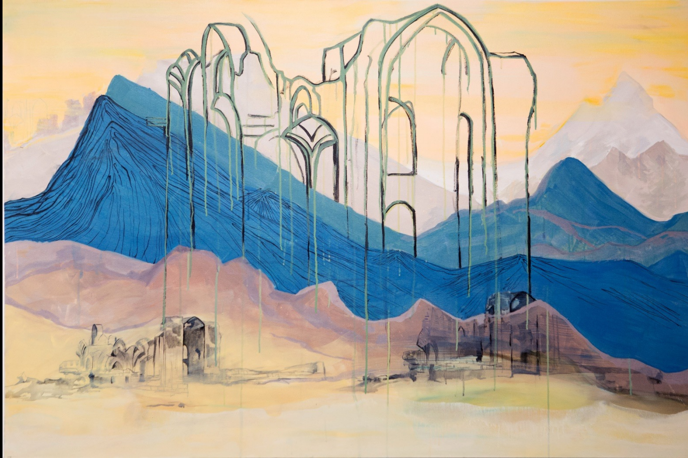
Liaison #1 Mixed Media on Canvas 49".72" 2014