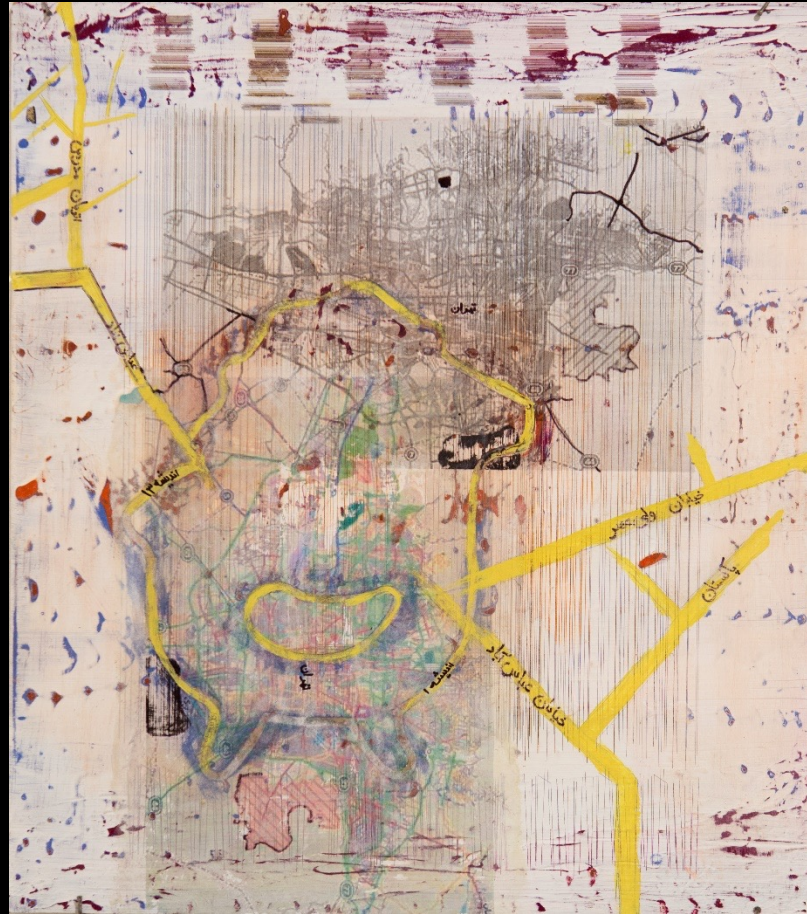
Tehran Mixed Media on Canvas 16" x 18" 2016