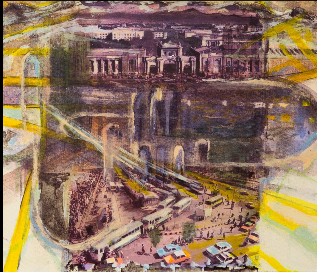
National Garden, Tehran Mixed Media on Canvas 17.5" x 15" 2016