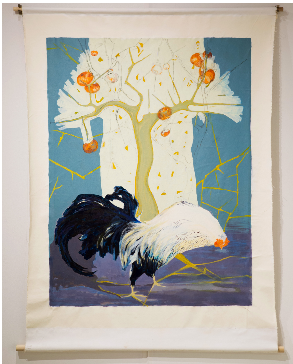
Rooster and the Persimmon Tree, 2016 Mixed media on canvas. Scroll painting 36x58" $1,500