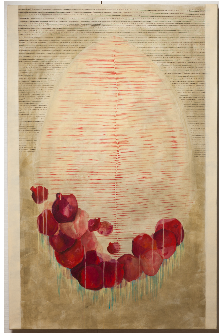
Mixed media on canvas, 2014 39x59" Price: $2,000