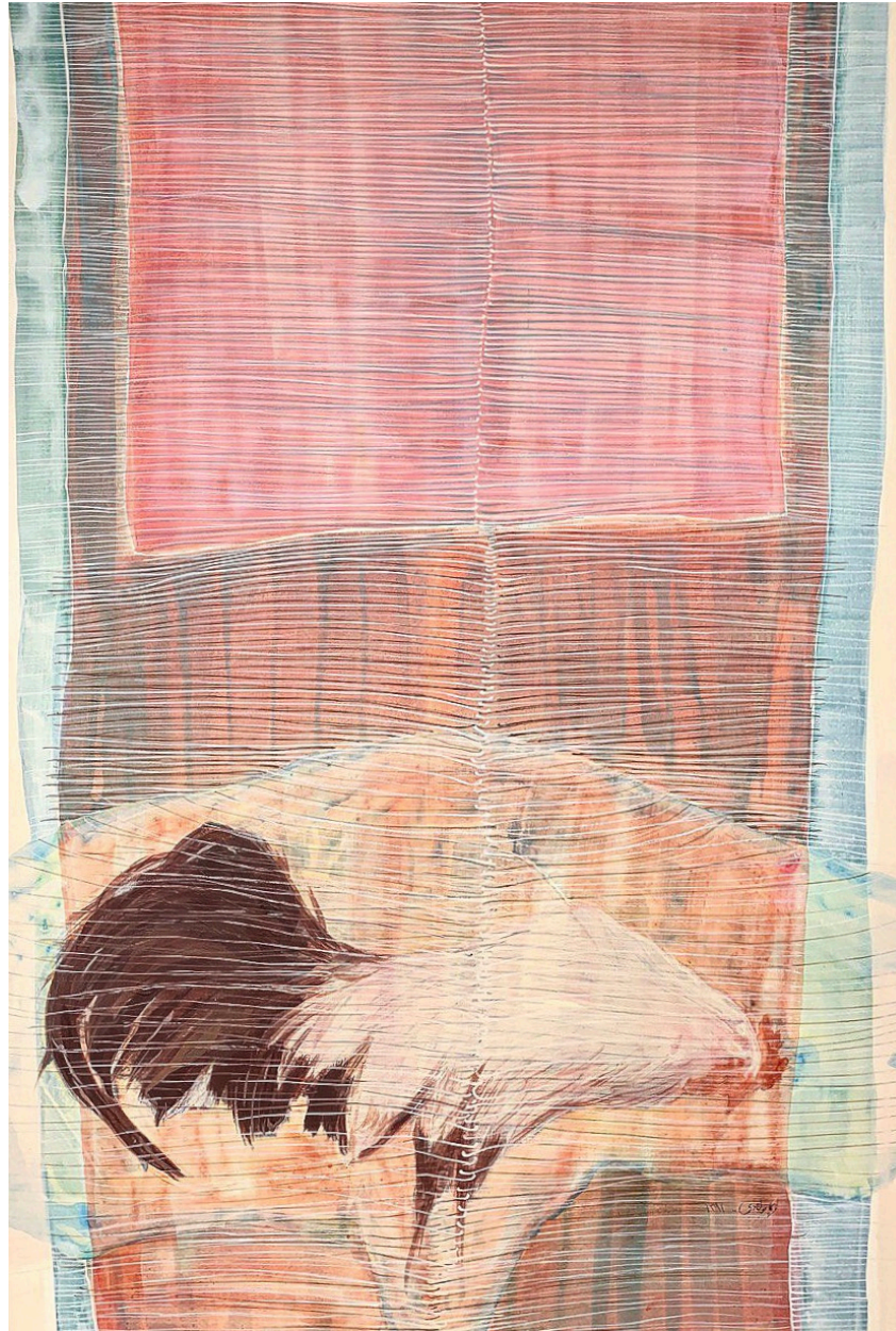
Acrylic on canvas, 2012 39x59" $4,000