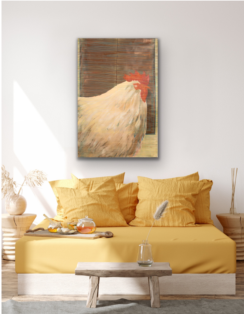
White Rooster, 2011 Acrylic on canvas 39x59" $1,500