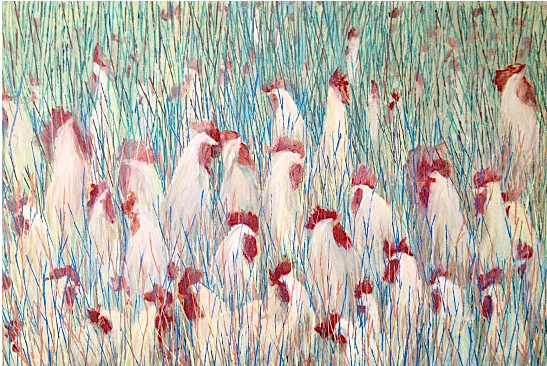
Senate II, 2012 Mixed media on canvas 39x59" Sold* Contact the artist for commission