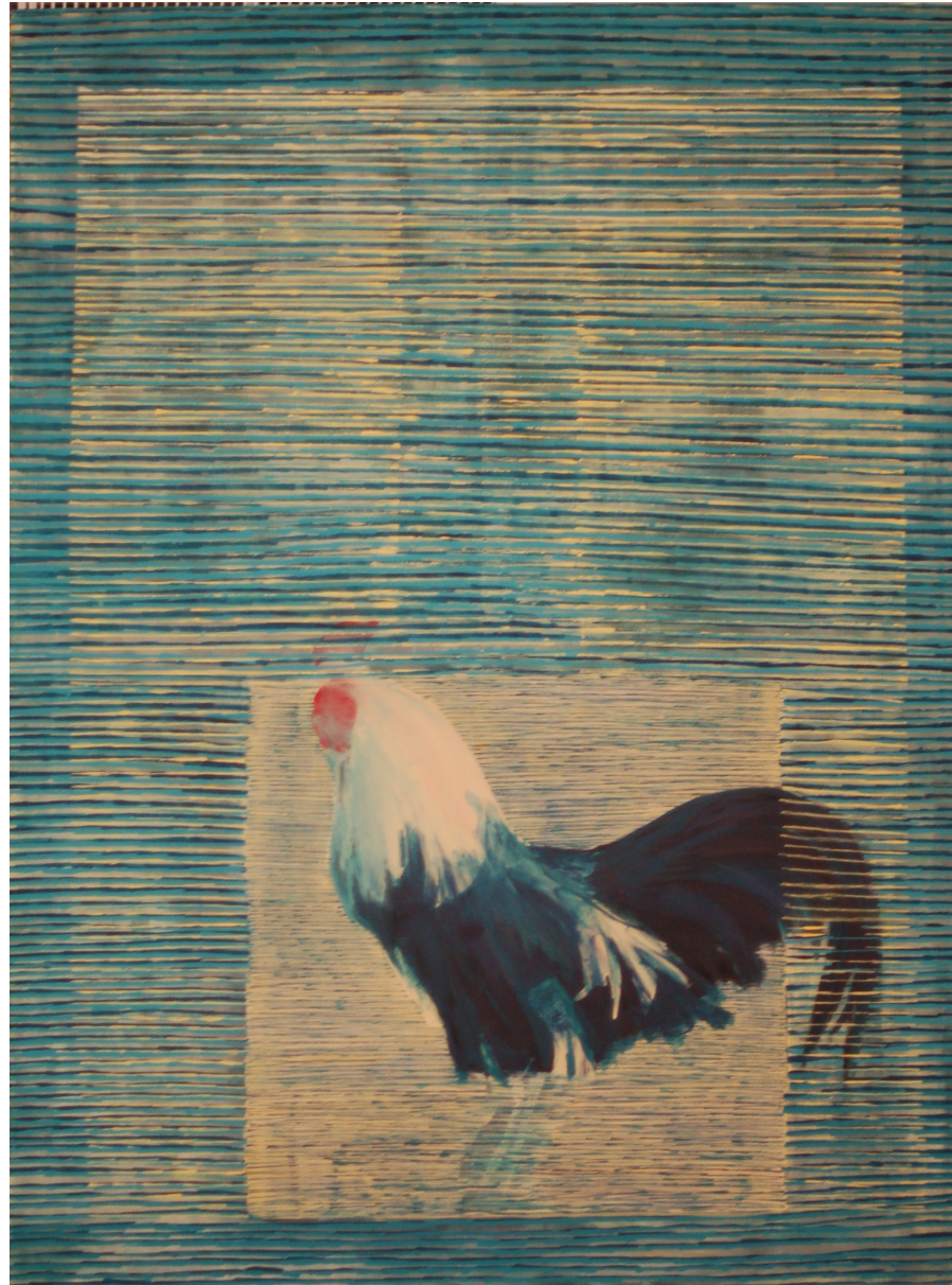
Blue Rooster, 2012 Acrylic on canvas 59x79" Sold* *contact the artist for commission