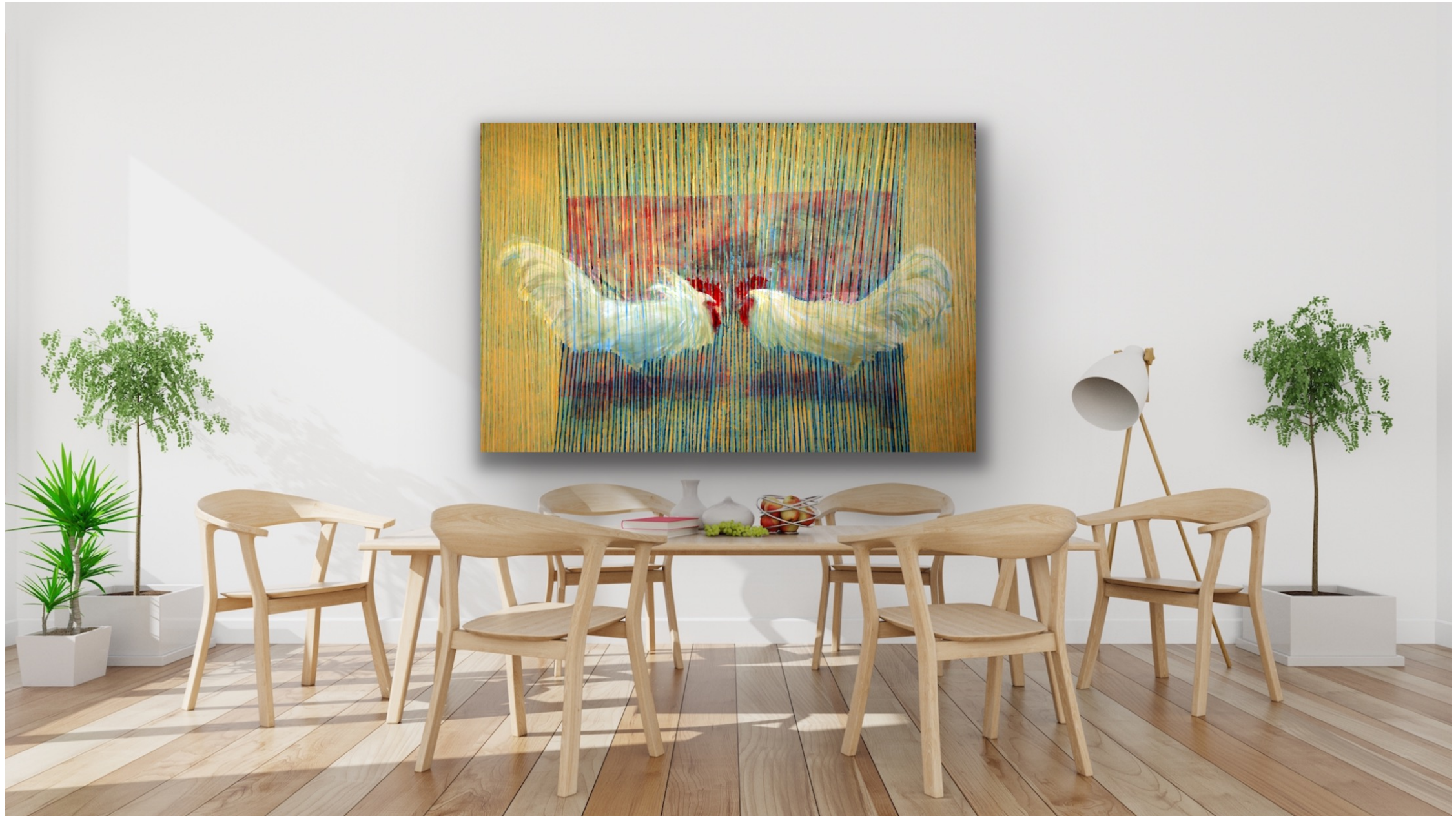
Acrylic on canvas, 2011 66x106" Sold* *contact the artist for commission