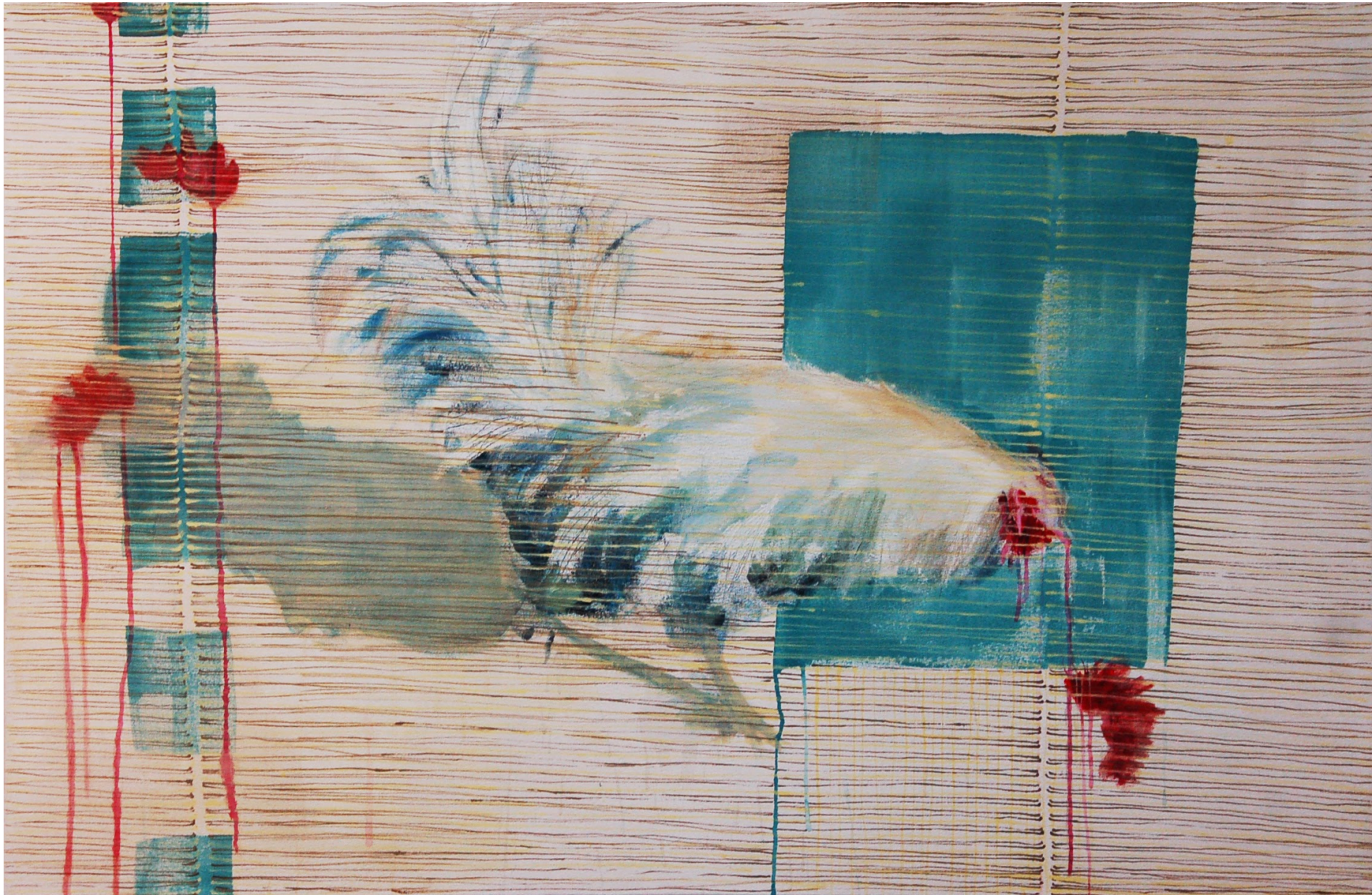
Dethroned, 2013 Acrylic on canvas 39x59" $ 3,000