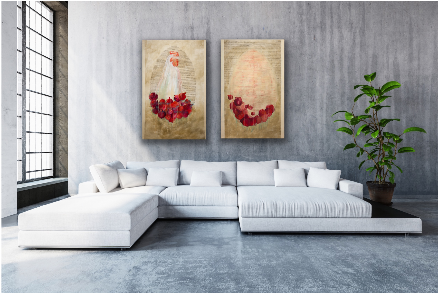
Mixed media on canvas 39x59" each Price for both: $3,200