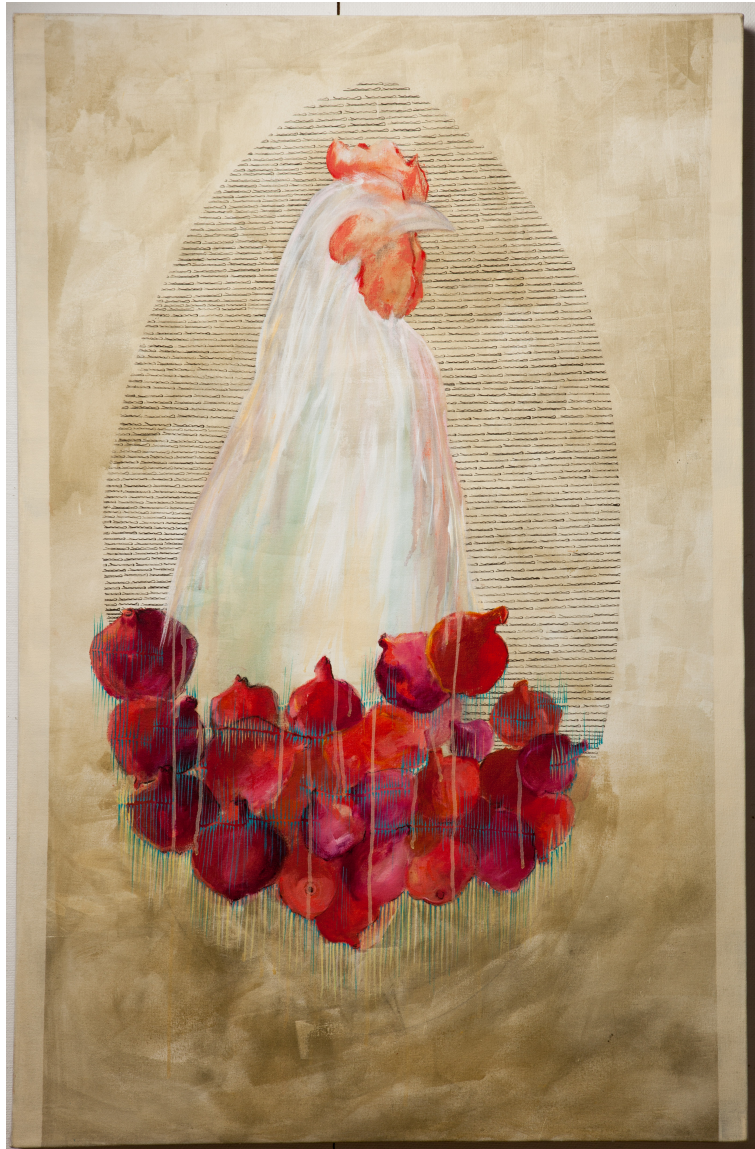
Mixed media on canvas, 2014 39x59" Price: $2,000